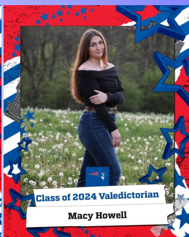
Class of 2024 Valedictorian