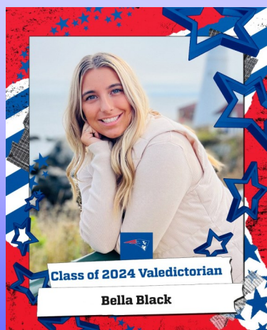
Class of 2024 Valedictorian