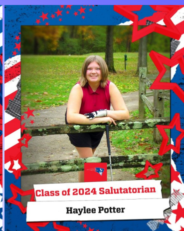
Class of 2024 Salutatorian