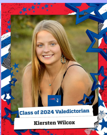
Class of 2024 Valedictorian